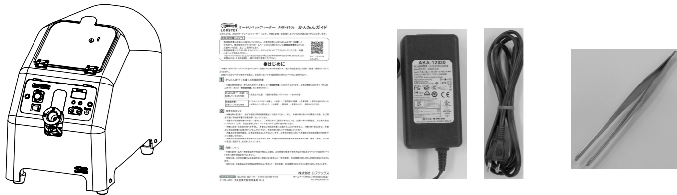
1.ARF-810E Main unit 2.Easy guide(this document) 3. AC adapter , Power cable 4.Tweezers

Make sure you have all of the following items: We take all possible measures to ensure the packaging is complete, but if anything is missing, please contact the store where you purchased the product